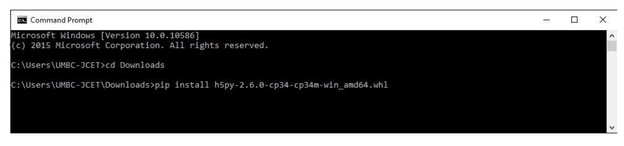
Figure 2: Example of downloading a package

By double clicking on the wheel you want to use, it will automatically download to your local downloads folder. At the command line, then navigate to your downloads folder and type "pip install your_wheel_file" at the command line (figure 2). This will download the package and all of its dependencies.