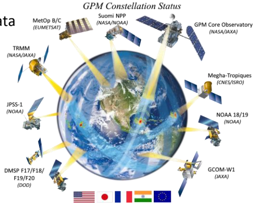
Illustration of the Global Precipitation Measurement Mission satellite constellation